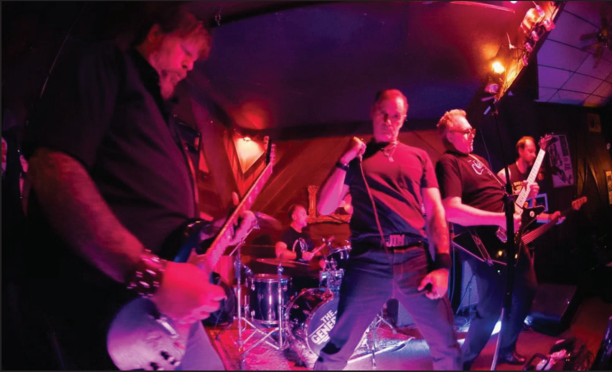
World Famous Kenton Club, Portland, OR